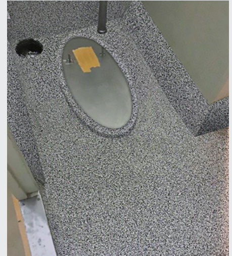
Installed SynDeck Ultra Lightweight Terrazzo Anti-Slip resin underlayment and coatings system includes integrally coated toilet riser.