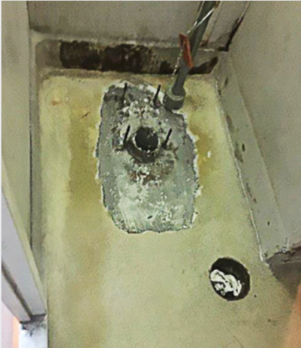
Damaged, stained and discolored deck coverings in head.