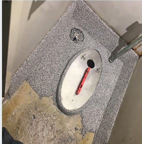
In process installation of a raised deck height, properly sloped, waterproof, full resin terrazzo system.