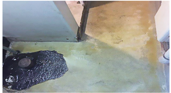
Cracked, delaminated and discolored original resin deck covering system.