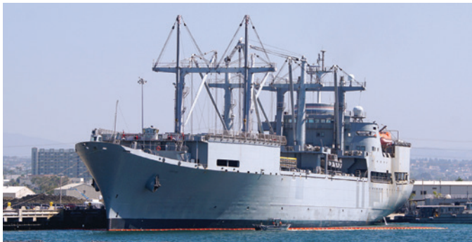
SS Curtiss (T-AVB-4 US Navy support ship)

A US Navy support ship needed replacement of damaged and poorly draining flooring in fourteen heads. Standing water caused installed resin underlayment and coatings to fail, producing visible cracks and delamination. Puddling water trapped grime and cleaning chemicals, undermining hygienic standards, maintenance and creating serious slip hazards. This continuous service area required a properly draining, waterproof solution to eliminate standing water and support hygienic standards and safety.